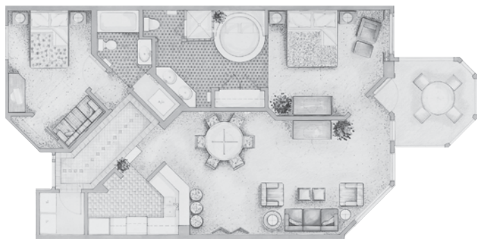
A typical 2-bedroom villa

Developer's conceptual rendering. Features, furnishings and amenities throughout this montage are proposed and subject to change.