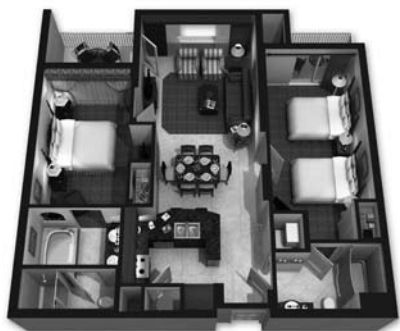
Developer's conceptual rendering. Floorplans, features, furnishings and amenities depicted throughout this montage maybe proposed and are subject to change.