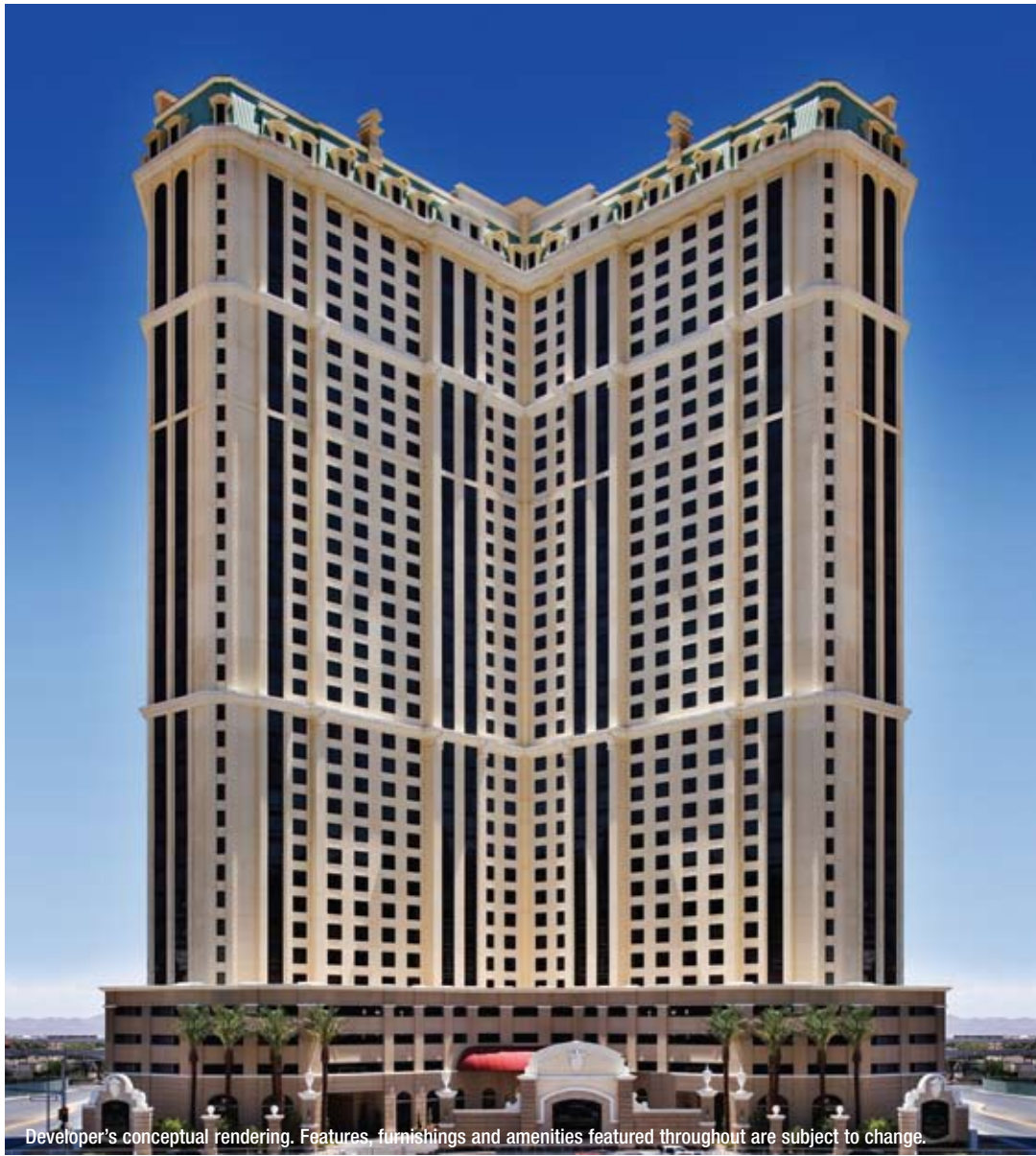
Developer's conceptual rendering. Features, furnishings and amenities featured throughout are subject to change.