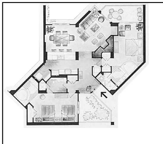
A typical 2-bedroom villa

Developer's conceptual rendering. Features, furnishings and amenities depicted throughout this montage may be proposed and are subject to change.