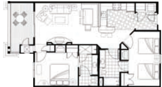
Developer's conceptual rendering of a typical floorplan. Features, furnishings and amenities featured throughout are subject to change.

For rental information: 800-845-5279 For ownership information: 888-240-3125