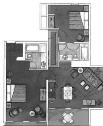
A typical 2-bedroom villa

Developer’s conceptual rendering. Features, furnishings and amenities throughout this montage are proposed and subject to change.