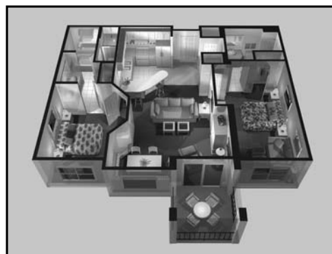
A typical 2-bedroom villa

Developer's conceptual rendering. Features, furnishings and amenities throughout this montage are proposed and subject to change.